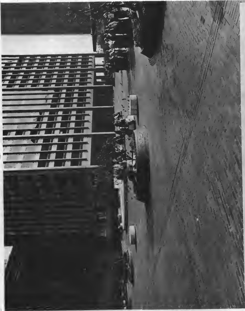
Jean Baptiste Point Du Sable Homestead, Chicago, Illinois Pioneer Court (looking E - SE inside Pioneer Court area